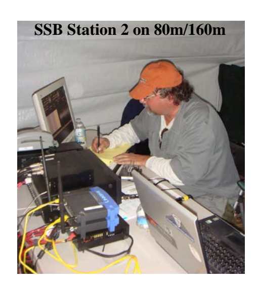
© FARS Reprints of selected articles permitted with acknowledgment to the FARS Relay