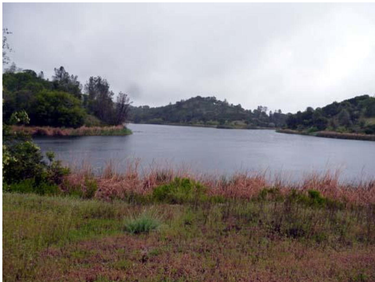
at Backcountry Weekend 2014