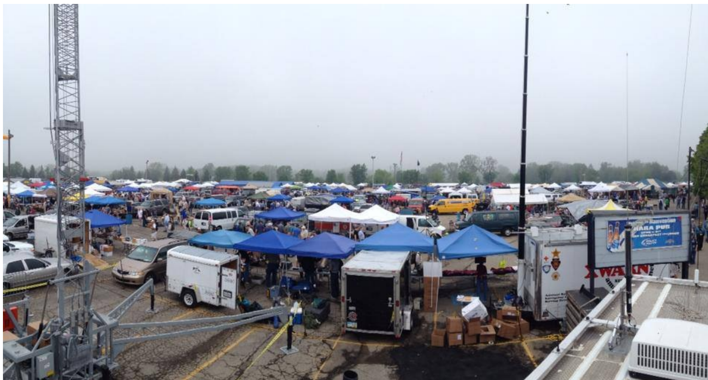
The Hara Arena as seen from a launched balloon.

I understand it rained only briefly Saturday morning, after which the fog and chill soon cleared to a lovely weekend. That's good news because the flea market is a significant aspect of the Dayton Hamvention experience. There's a high probability you'll find what you're looking for as there were 731 vendors !!