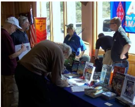
The ARRL table keeps busy.