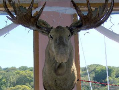
Location: Moose Family Center

On Saturday, March 23 rd hams traveled to Del Rey Oaks near Monterey for “RadioFest 2013”, an ARRL Santa Clara Valley Section Convention. Sponsored by the Naval Postgraduate School Amateur Radio club, the convention hosted vendor booths, ham radio demonstrations, a swap meet, license exams, speakers, raffle prizes, as well as Parachute Mobile.