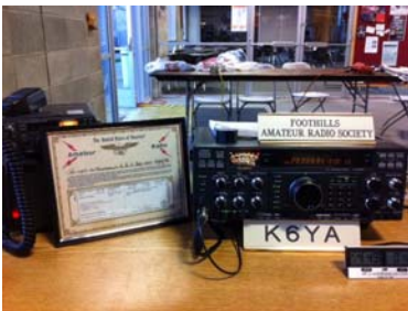
The K6YA Get-On-The-Air Station, ready for some QSO's during Am-Tech Day

An open 10 meter band during the ARRL 10 Meter Contest provided for some additional excitement at December's Am-Tech Day, though shifting band conditions were also a challenge.