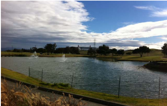
View from Michaels at Shoreline