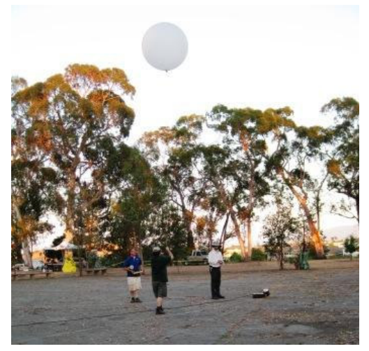
Launching the Balloon, 2009