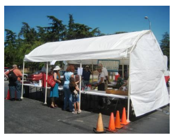
The Food Tent