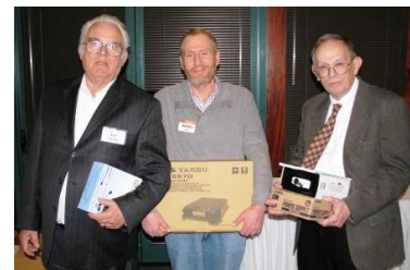
Banquet Raffle Winners