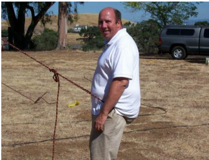
Who needs stakes?