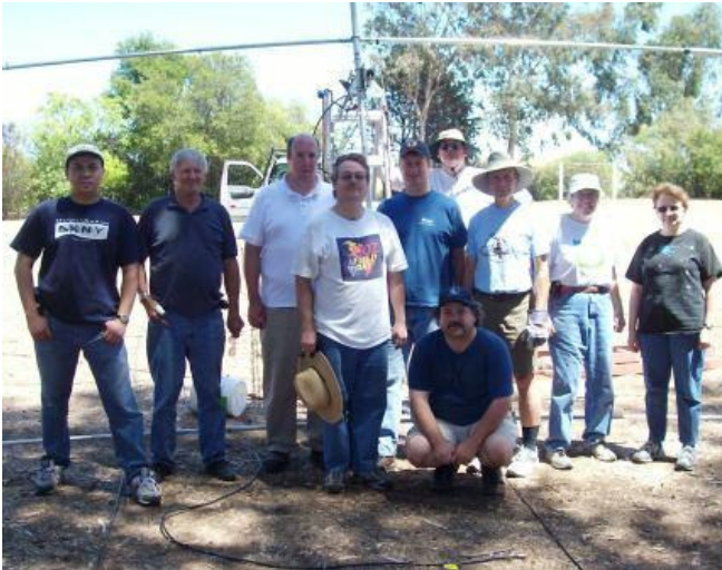
The Setup Team