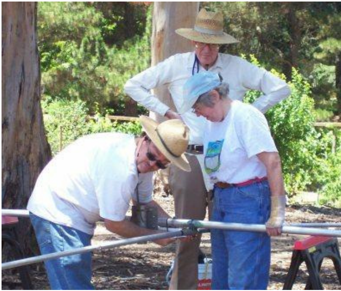
Assembling the Antenna