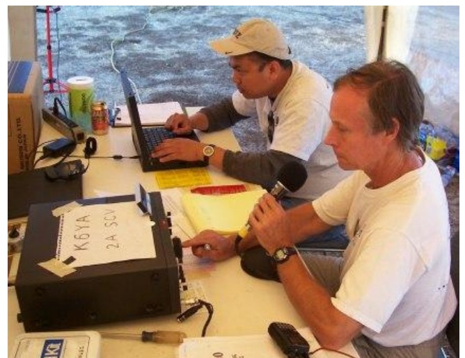
Sideband (SSB) Station