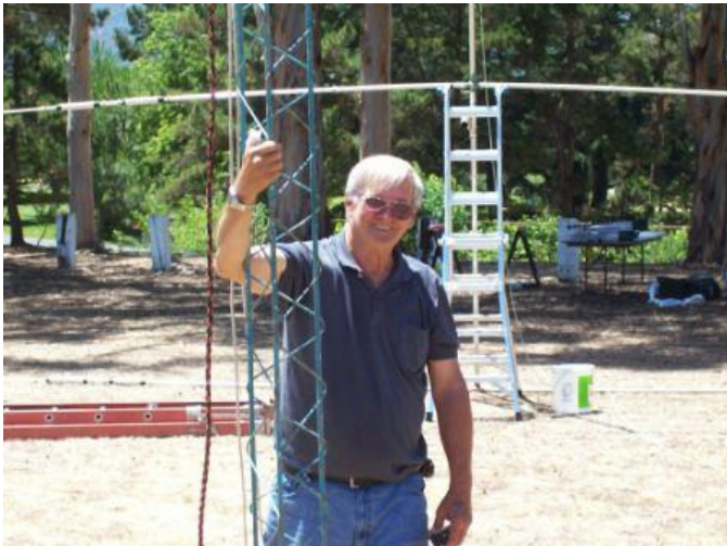
I can hold this, even with a bad thumb