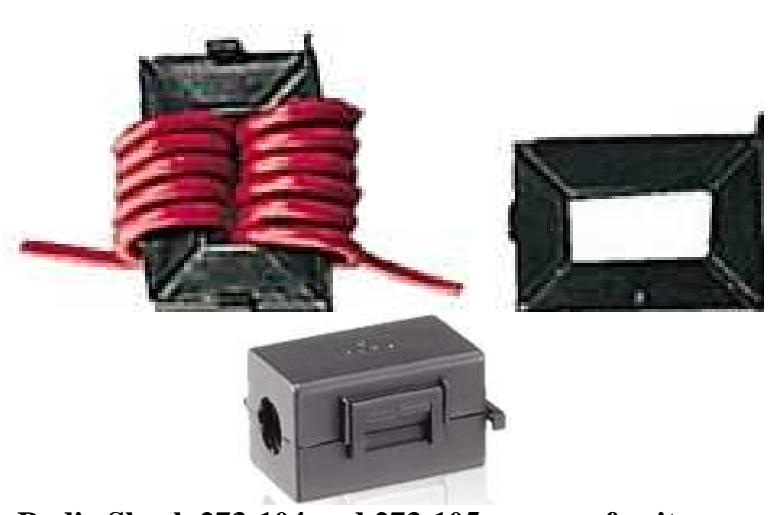
Radio Shack 273-104 and 273-105 snap-on ferrite chokes.