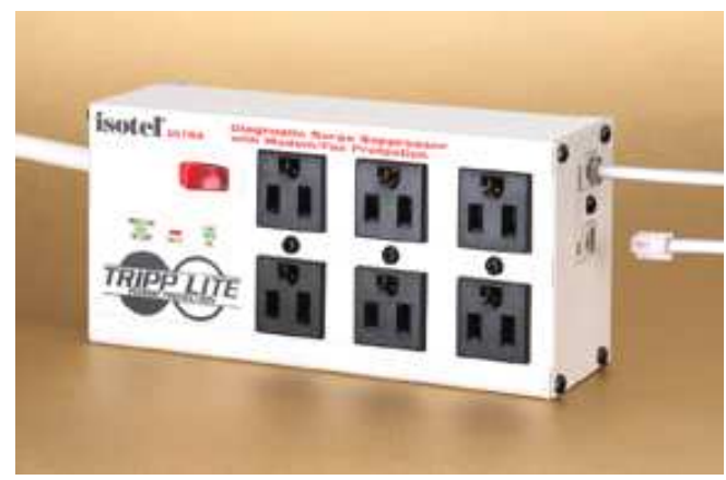
Radio Shack 279-151 and Tripp Lite Isotel6ultra.