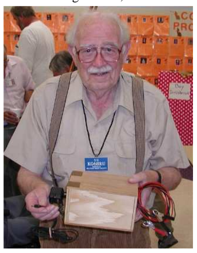
KG6HRU, Sig, Distributor for battery power