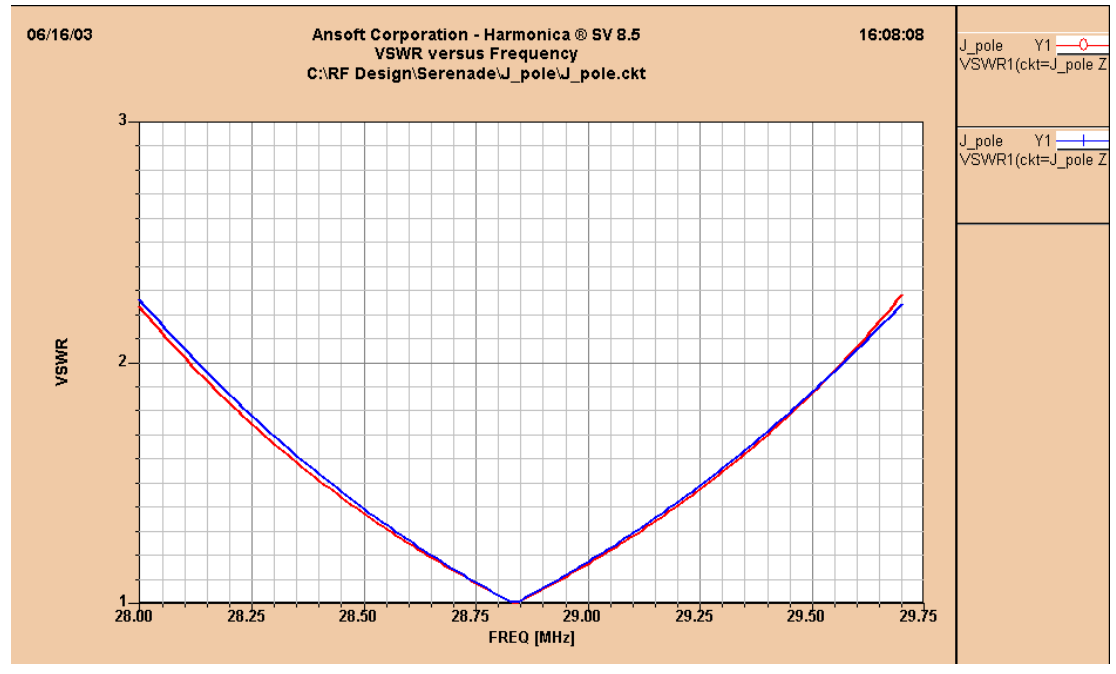
Figure 3. VSWR of 10-meter J-pole with matching section set for 50 ohms.