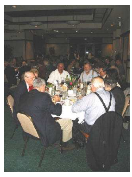
The banquet room was packed, but there was room and food for all.

More photographs available at <a href="http://www.koskiphotography.com/fars/2003-banquet/FrameSet.htm">http://www.koskiphotography.com/fars/2003-banquet/FrameSet.htm</a>