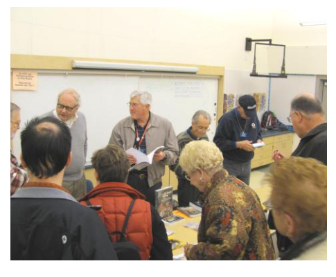
HRO show n tell

Friday, January 20th Save the date for the Annual FARS / PAARA Banquet!