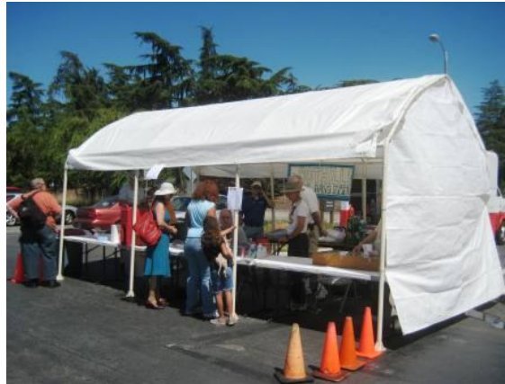
The Food Tent