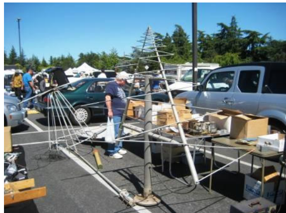
Antennas at the Flea Market