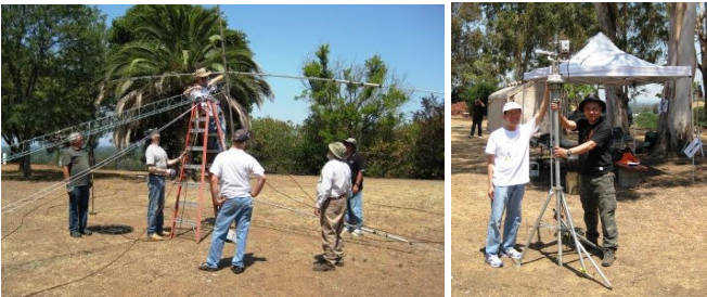
Field Day 2009 Setup