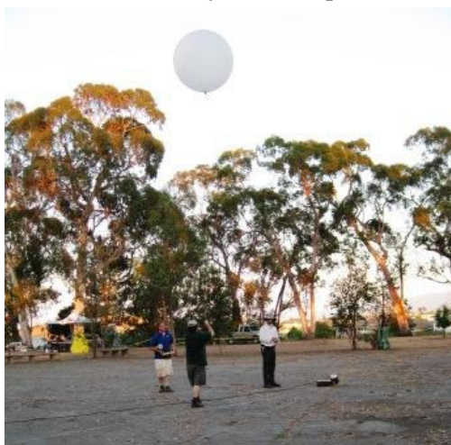
Launching the Balloon, 2009