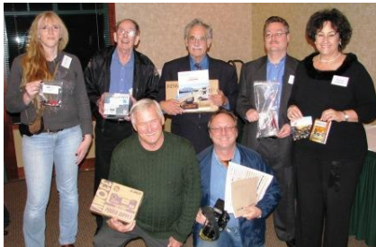
2010 Winter Banquet Raffle Winners

There were great prizes at the banquet. See later in this Relay for more information on the prizes and the winners shown in the photograph above.