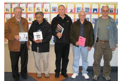
1 st through 4 th Raffle Winners and WYWH